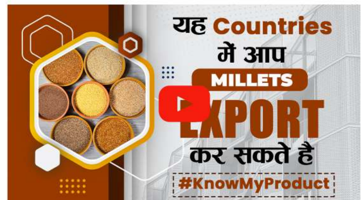
यह Countries में आप Millets Export कर सकते है