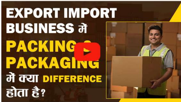
Export Import Business में Packing & Packaging में क्या Difference होता है?