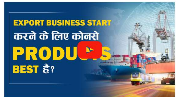
Export Business Start करने के लिए कोनसे Products Best है?