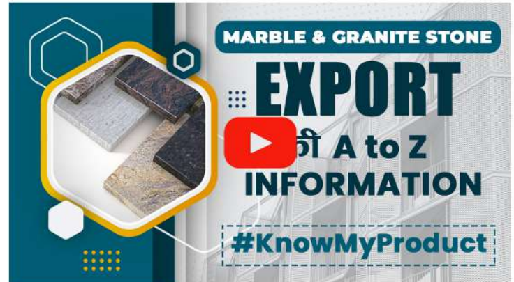
Marble & Granite Stone Export की A to Z Information