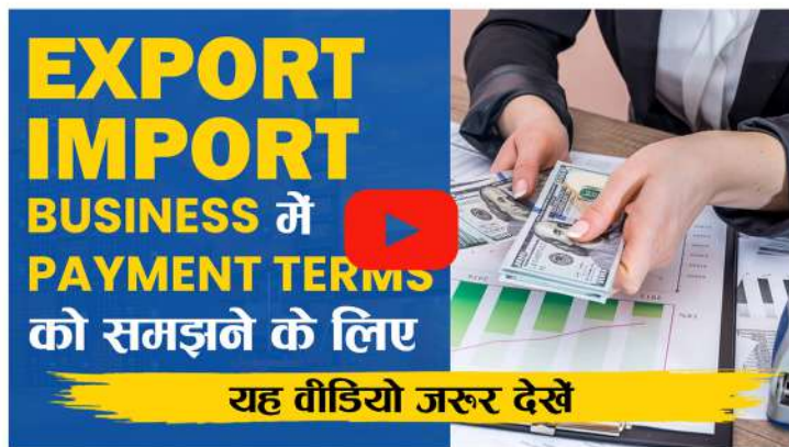
Export Import Business में Payment Terms को समझने के लिए यह वीडियो जरूर देखें